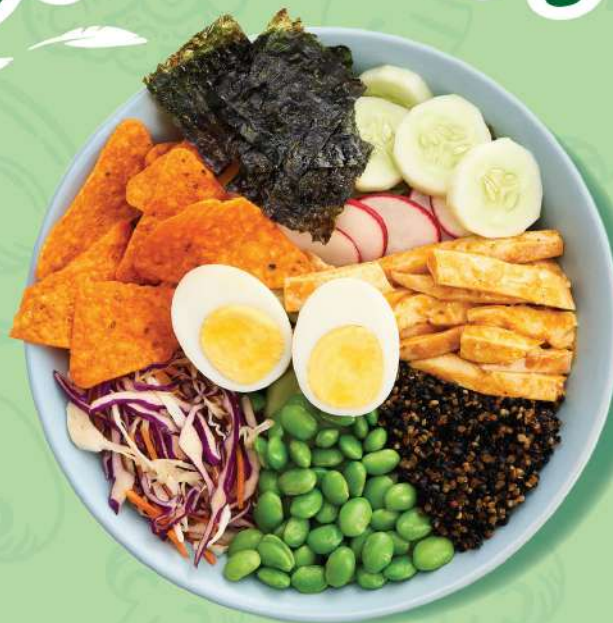
SUMMER BOWL Marinated chicken, quinoa, egg seaweed, edamame, crispy tortilla