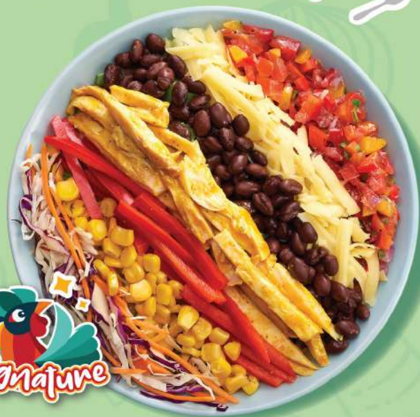
PULLED CHICKEN SALAD Kidney beans, cheddar, corn, salsa peppers, mixed leaves