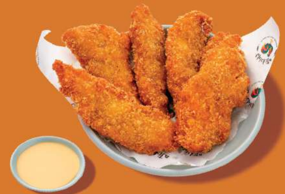
CRISPY TENDERS Cheese sauce (3PCS / 5PCS)