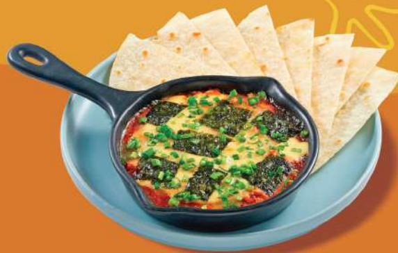
FIRE CHICKEN Spicy sauce, seaweed melting cheese