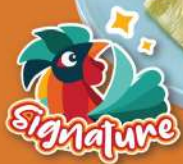
BBQ PRAWN TACOS Eda-mole, mango lime sauce (2 PCS)