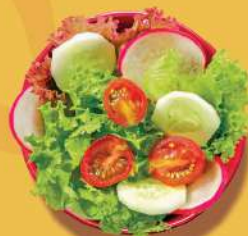
GARDEN SALAD Sesame dressing