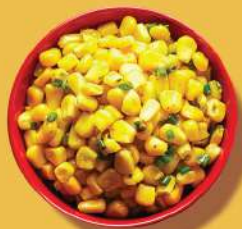
FARMED CORN GARLIC BUTTER