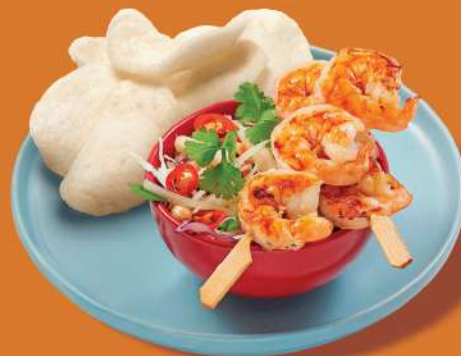
GARLIC PRAWN SKEWERS Lotus root, herbs, prawn cracker calamansi dressing