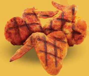
CHICKEN WINGS (3 PCS)