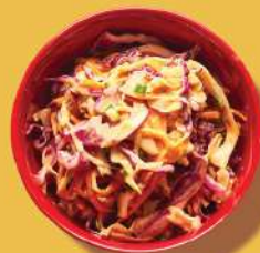
COLESLAW Creamy dressing