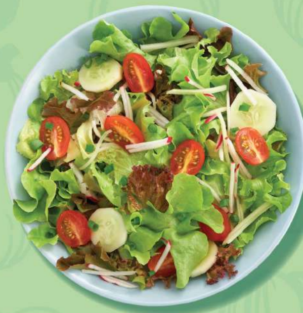
HIGHLAND SALAD Cucumber, tomato, radish, lettuce