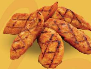
CHICKEN TENDERS (5 PCS)