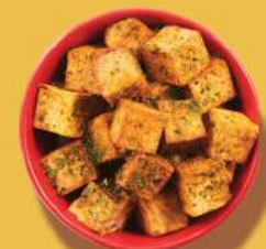
YAM POPS Seaweed seasoning