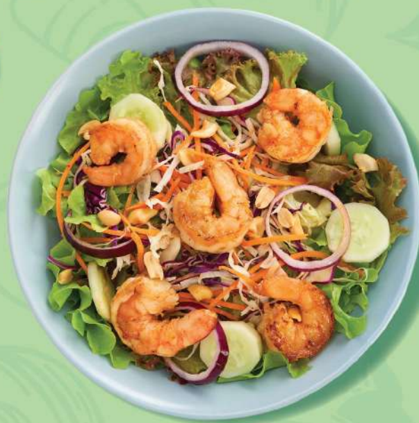
BBQ PRAWN SALAD Carrot, cabbage, peanuts, red onion