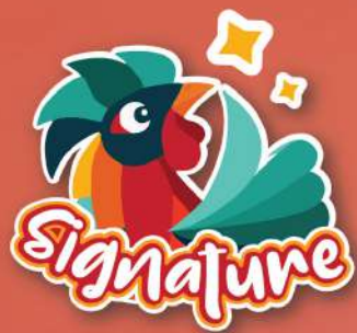
SIGNATURE HOT CRAB DIP Cream cheese, toasted pita