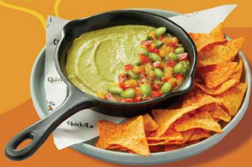
EDA-MOLE DIP Eda-mole hummus, salsa crispy tortilla