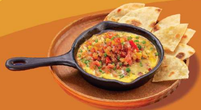
CHICKITA'S NACHOS Chicken, Original sauce, cheese sauce, salsa, toasted pita