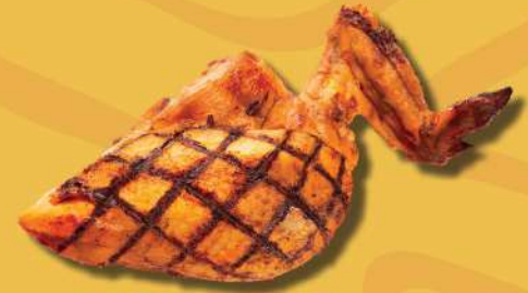
1/4 CHICKEN BREAST