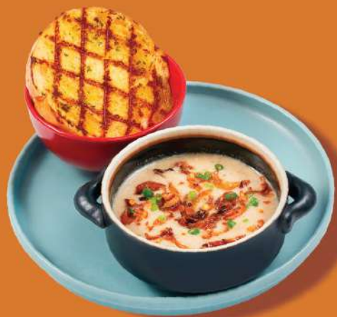
SLOW ROASTED MUSHROOM SOUP Caramelized onion, grilled garlic bread