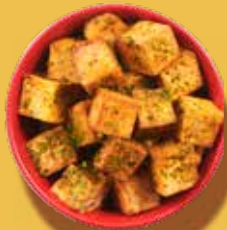
RM8.00 YAM POPS Seaweed seasoning