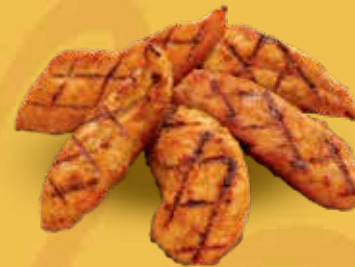
RM18.50 CHICKEN TENDERS (5 PCS)