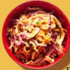
RM7.00 COLESLAW Creamy dressing