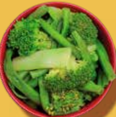
RM8.00 STEAMED GREENS