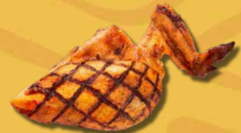
RM17.50 1/4 CHICKEN BREAST