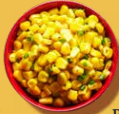
RM7.00 FARMED CORN GARLIC BUTTER