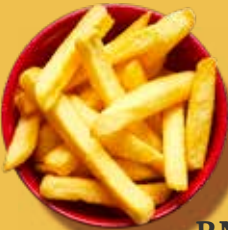
RM8.00 CRISPY FRIES