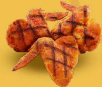
RM18.50 CHICKEN WINGS (3 PCS)