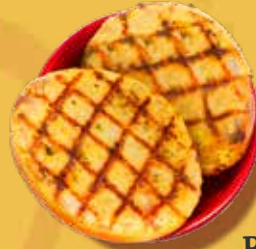
RM7.00 GARLIC BREAD