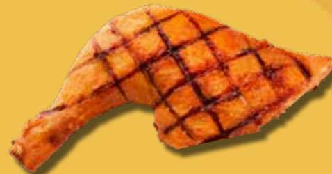
RM17.50 1/4 CHICKEN LEG