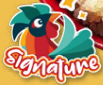
RM7.00 CHICKEN RICE