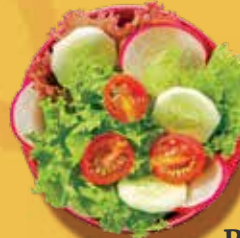
RM8.00 GARDEN SALAD Sesame dressing