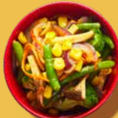
RM8.00 WOK VEGETABLES